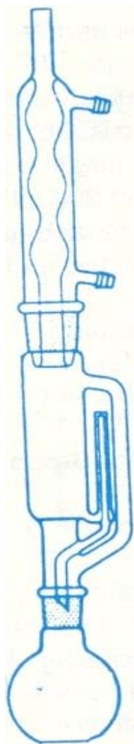
Fig. 2 - Apparatus for the continuous extraction of Drugs (Soxhlet apparatus)